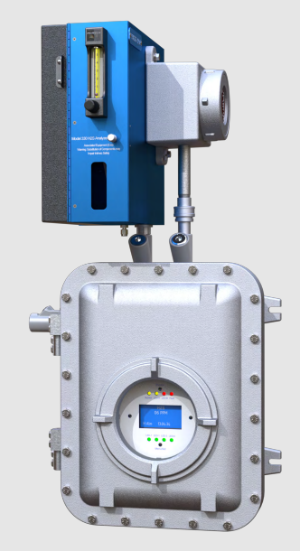
330S H<sub>2</sub>S ANALYZER