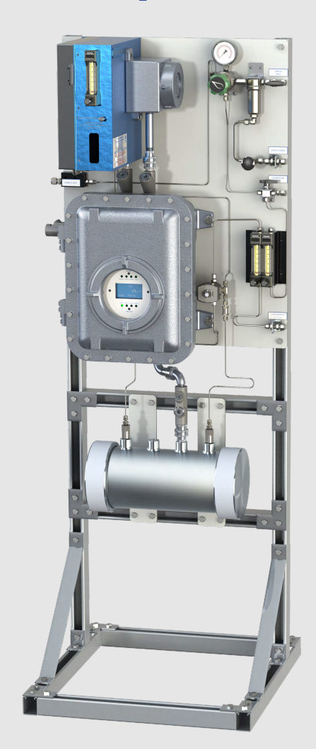
330S H<sub>2</sub>S-Total Sulfur Analyzer WITH STANDARD SAMPLE CONDITIONING